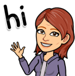
Corey Daddezio VP-State Rd.